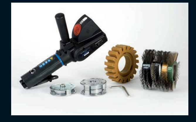
Item Code SP-110-BMC Item Code SP-110

Also, the Vinyl Zapper<sup>®</sup> is included in our sets for applications in Automotive industry e.g.