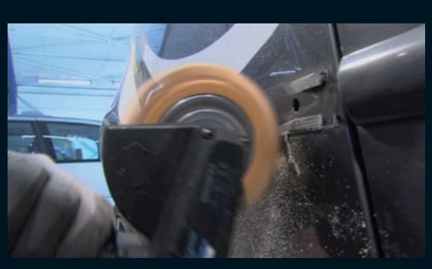
Removeal of adhesive residues

The Vinyl Zapper<sup>®</sup> is installed using a specially designed MONTI adaptor system mounted onto either the MBX<sup>®</sup> pneumatic Heavy Duty or electric drive units.